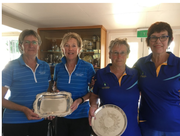
Totaradale Foursome Winners