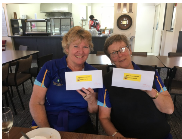
Totaradale Foursome Country Rovers