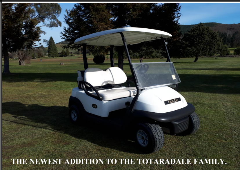
THE NEWEST ADDITION TO THE TOTARADALE FAMILY.