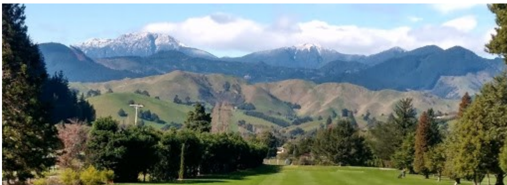
View from #1 green looking back to the Richmond Ranges - simply stunning